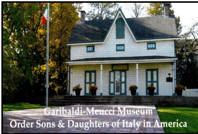
Garibaldi-Meucci Museum Order Sons & Daughters of Italy in America

Order Sons & Daughters of Italy in America Grand Lodge of California